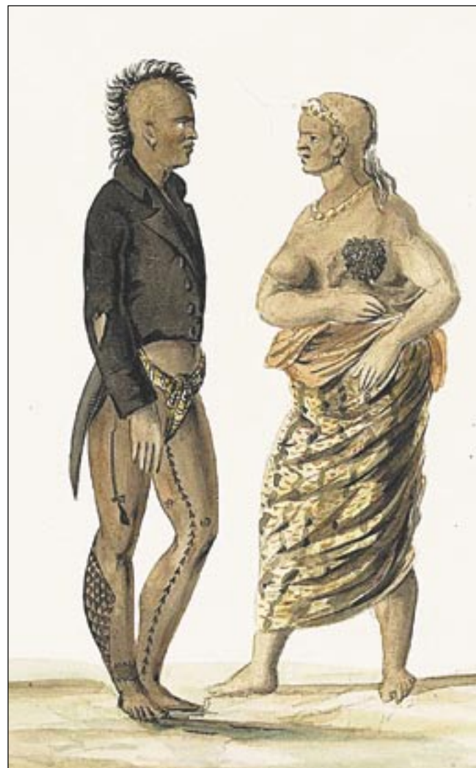
"[The women] make drawings of necklaces and garters on the skin in a manner really wonderful; their other devices consist of hunting-horns, helmets, muskets, rings, but more particularly fans and goats. Those of the men are muskets, cannon, goats and dominoes; together with the name of Tamehameha [Kamehameha] and the day of his death." – Jacques Arago, 1819.